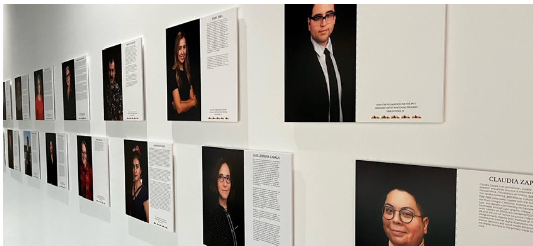
Image: Detail of a photo of Artist Profiles from “New York Foundation for the Arts (NYFA) Immigrant Artist Mentoring Program Exhibition – Round 2,”

Introducing Monday Motivation News NYFA Coaching NYFA Source Register Now Statement The Art of the Application