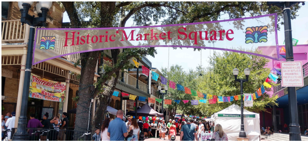
Photo: Historic Market Square, San Antonio

Click here for more information on the Immigrant Artist Mentoring Program. And don't forget to sign up for the monthly Con Edison Immigrant Artist Program Newsletter to receive opportunities and events as well as artist features directly to your inbox.