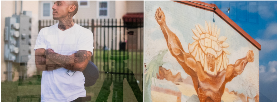
Image Detail: Artwork by Francisco Cortés

San Antonio exhibit is inspired by the NYFA's Immigrant Artist Mentoring Program, which pairs emerging foreign-born or first-generation artists with experienced artists for mentorship, development, and encouragement.